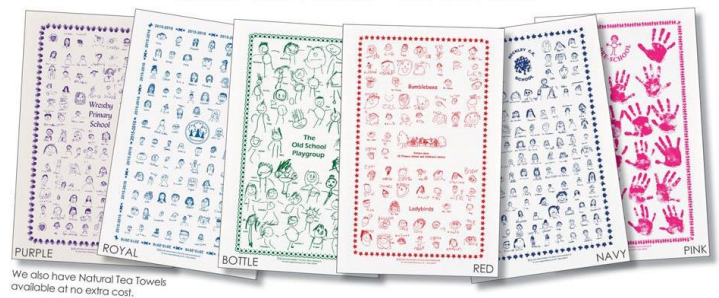
We also have Natural Tea Towels available at no extra cost.

Class of 2021/2022 Tea Towels – the children are working on their portraits for the class of 2021/2022 tea towels. An email will follow later this week with all the details on how you can order yours AND raise some money for the pre-school in the process.