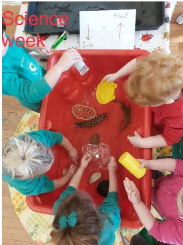
Sink or Float?....teaching our children about density and buoyancy