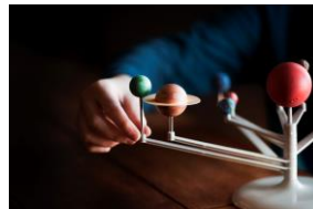
Patterned planets - created by rolling beads in paint, lots of discussion on the names of planets