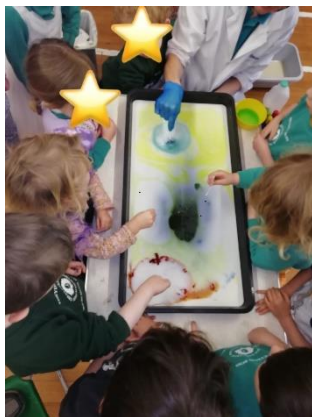
Ingredients - Milk, washing up liquid & food colouring...lots of new language used and learning/seeing how the liquid disperses, changes colour and patterns develop when the children dripped food colouring in using pipettes.