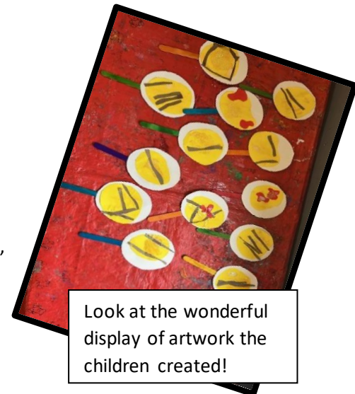
Look at the wonderful display of artwork the children created!

They created some magnificent artwork, explored the free play tuff tray set up and took part in a pancake flipping activity at circle time. Everyone had so much fun today. We hope you enjoyed Pancake Day too!!