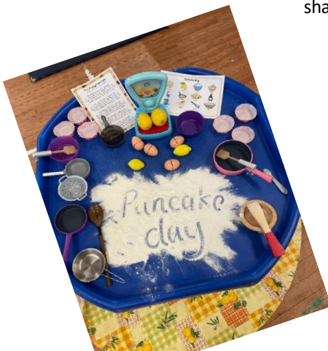
The Children enjoyed exploring our role play Pancake area.

The staff wanted the art table to be a child lead activity, so they stuck the pancakes onto the frying pan, whilst talking about what their favourite topping would be, Sugar (Glitter), Chocolate (Brown paper), Jam (Red paper) all stuck on independently by the children. What is your Favourite topping?