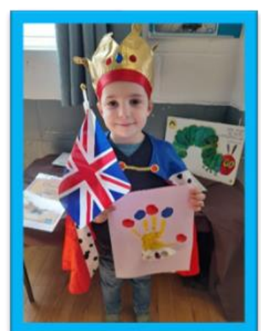
Look at our fantastic King who attended PreSchool. How fantastic does he look?